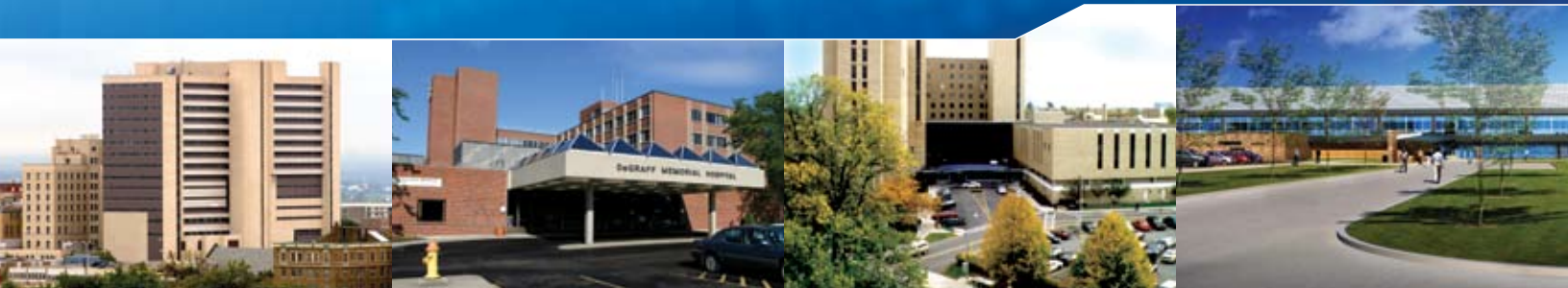
BUFFALO GENERAL HOSPITAL